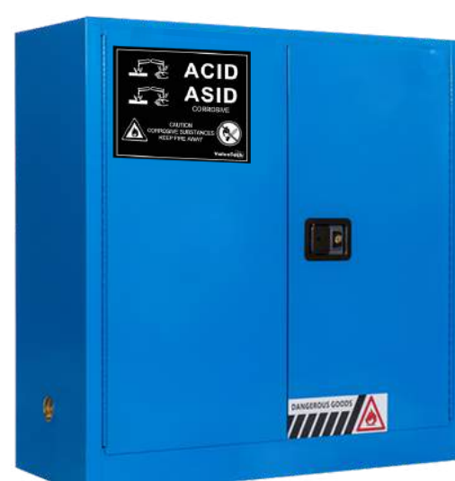
30 GALLONS ( 2 DOOR )