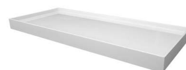
Anti- corrosive PP tray