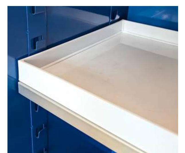
Anti-corrosive PP tray to contain the spill