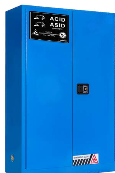
45 GALLONS ( 2 DOOR )