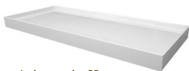
Anti-corrosive PP tray