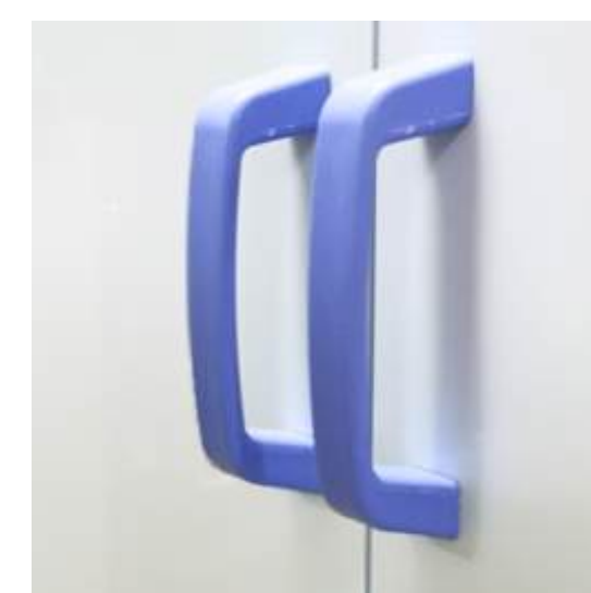
PP door handle