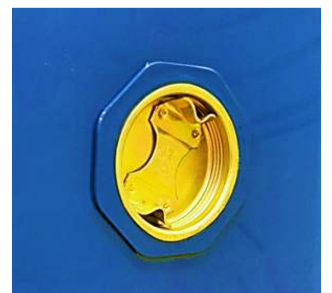
Air vent bung cap ( Outer )