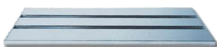
Galvanized anti-flow shelves are suitable for all storage cabinet