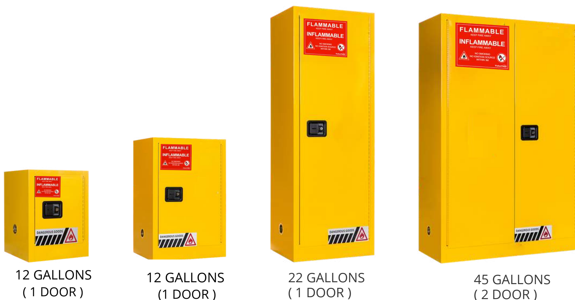
12 GALLONS ( 1 DOOR )