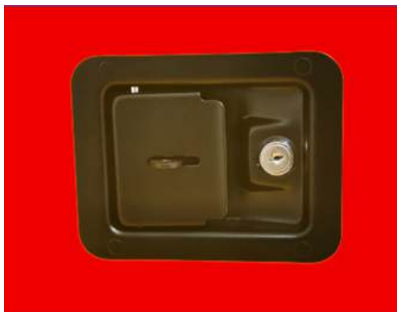
Highly secure door latch with dual protection