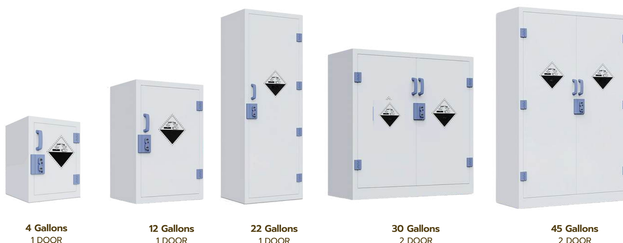
4 Gallons 1 DOOR

PP (Polypropylene) Acid Cabinet is the best solution to store strong acid and corrosive substance, for example, sulphuric acid, hydro- chloric acid, nitric acid, sodium hydroxide, potassium hydroxide etc.) Store your most corrosive chemicals with no fear of rust or corrosion of your storage cabinet.