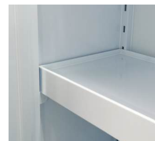
Adjustable PP shelf