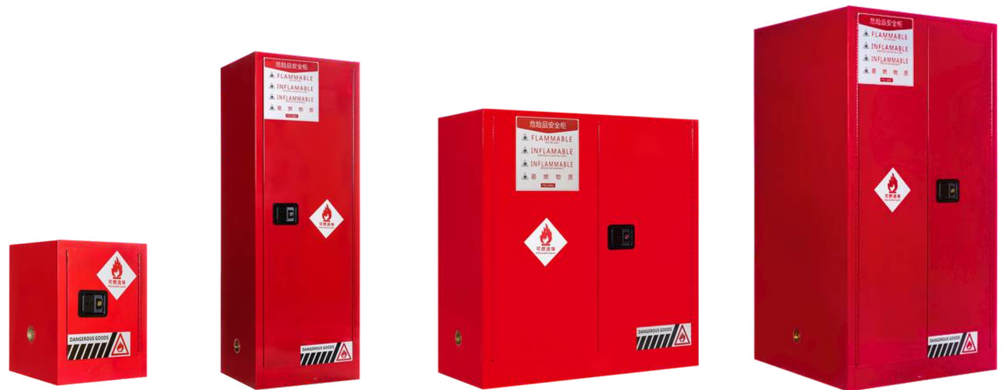
4 Gallons 1 DOOR