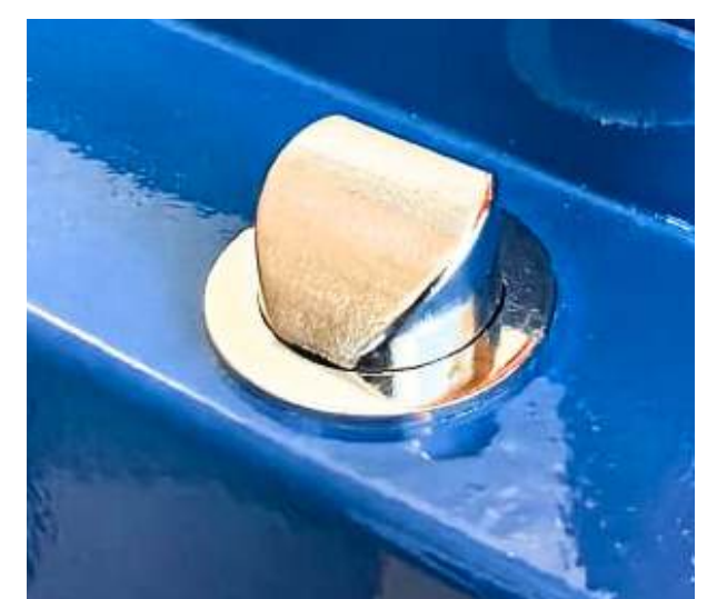
Inter locking system