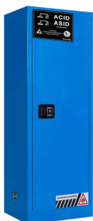
22 GALLONS ( 1 DOOR )