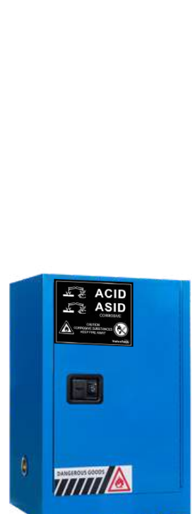
12 GALLONS ( 1 DOOR )