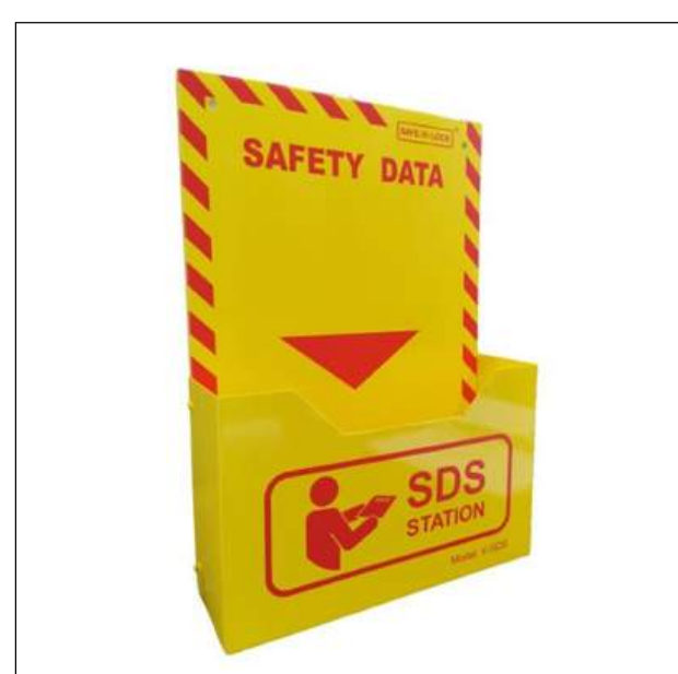
Optional : SDS Station